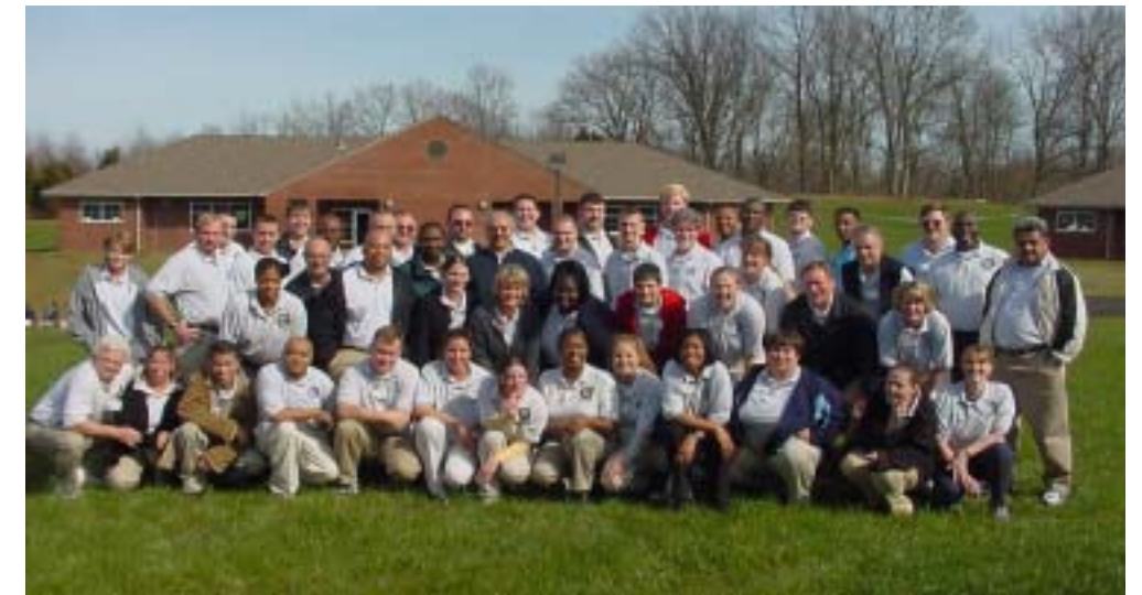
Academy 45 graduating class, Elizabethtown, April 1, 2005

Academy 45 participants who met EKU admissions criteria will be awarded 6 hours of COR 106 undergraduate credit for their Academy training. Academic credit will be processed in the Fall 2005 and will appear on student transcripts in January 2006.